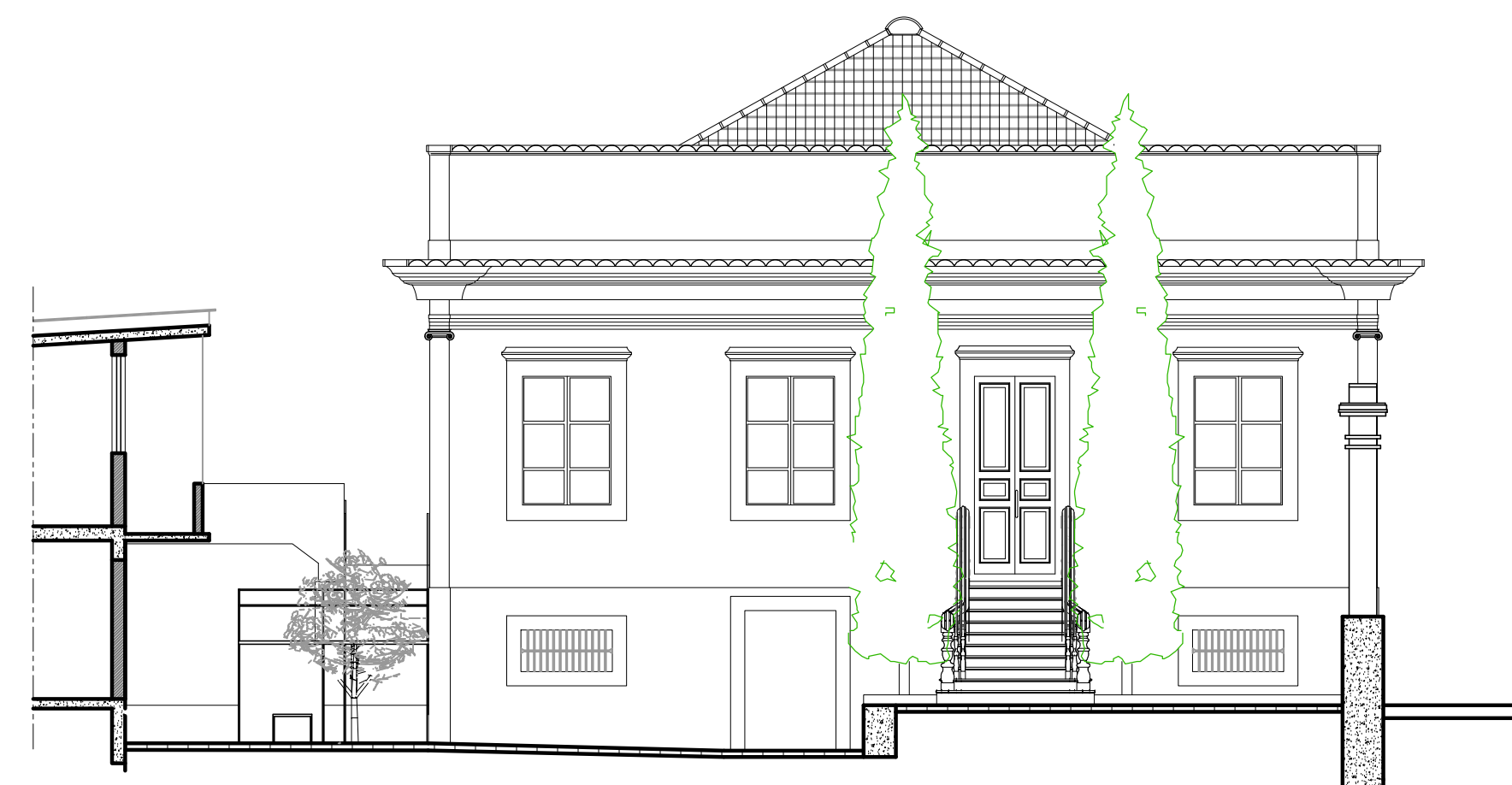
FACHADA LATERAL 02 ESC. 1/75